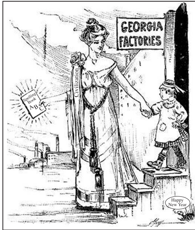
The State of Georgia welcomes the operation of the new Child Labor Law.

Source: L. C. Gregg, Atlanta Constitution , 1907 (adapted)